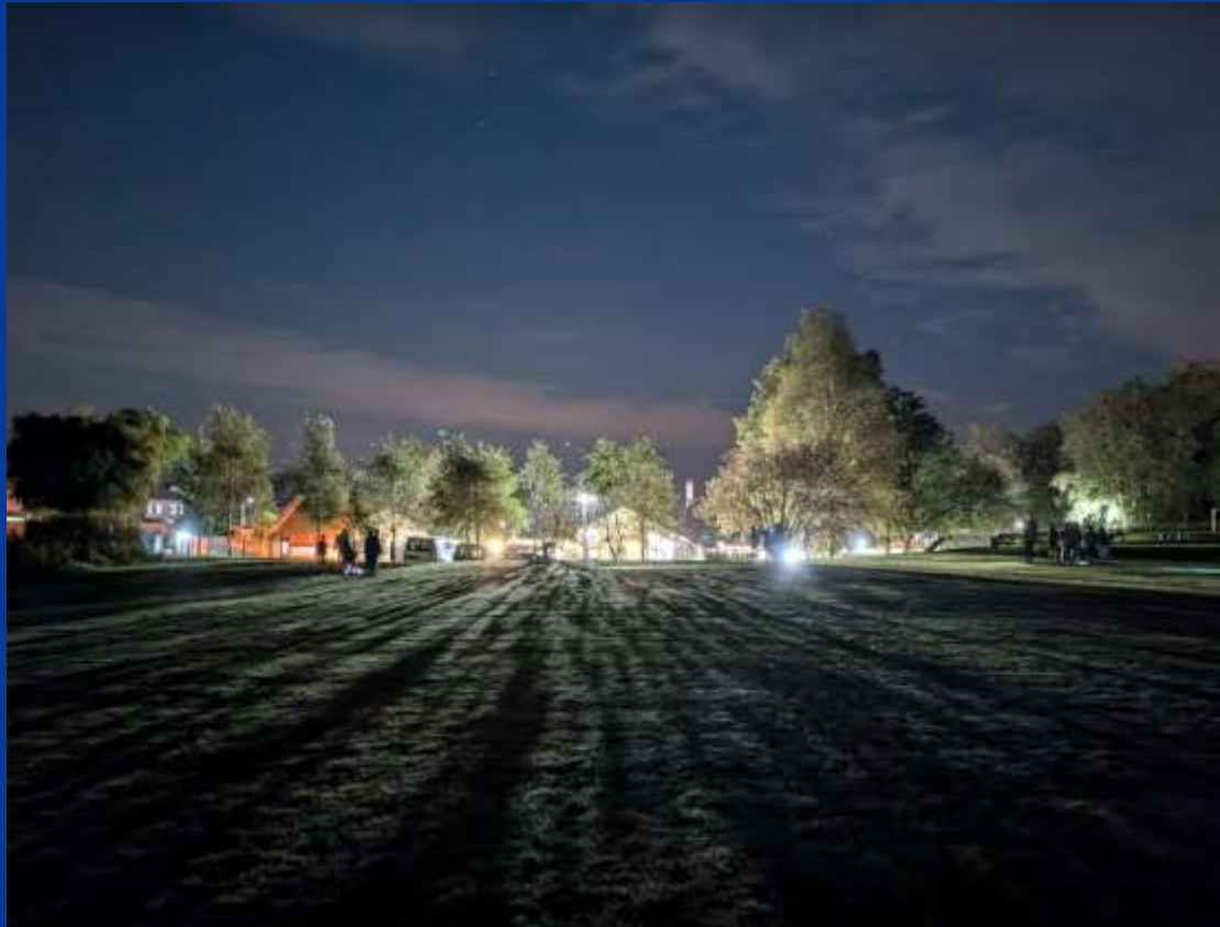
St Mary's School at night, this week during the residential for Year 5 and 6

Church of England Primary School Kirkby Lonsdale