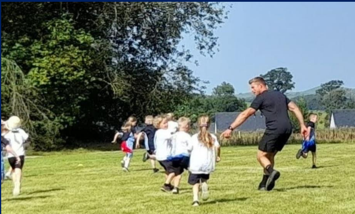
P.E. on day one of Autumn Term

Church of England Primary School Kirkby Lonsdale