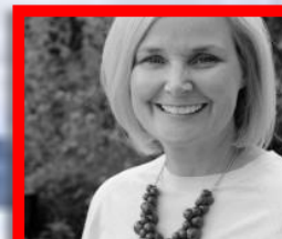
Lee Dancy Foundation