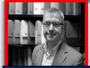
Graham Gladwinfield Foundation

FSRHS – Finance Staffing Resources Health and Safety