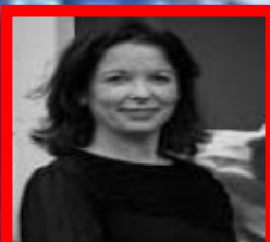
Lisa Lodge Foundation